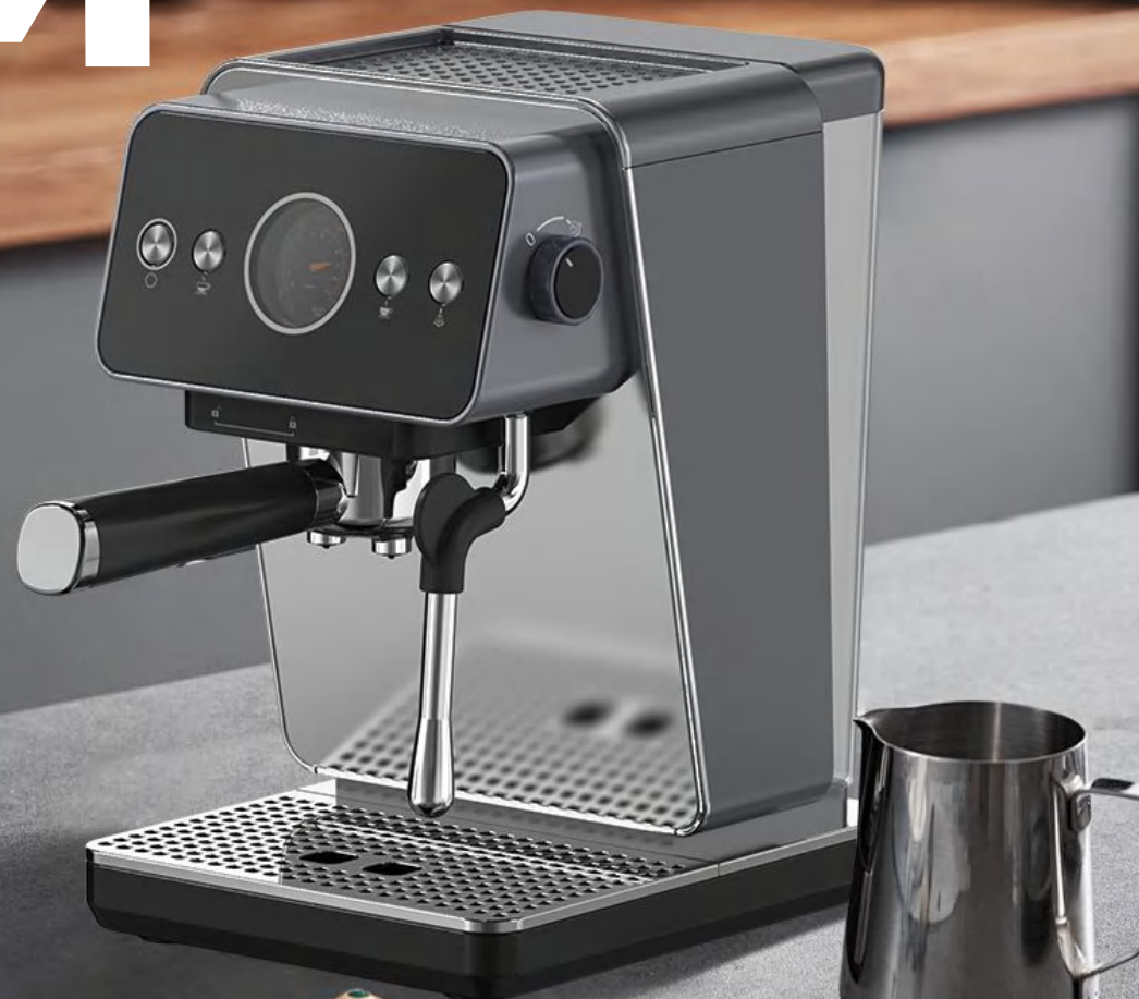
WIDE BODY ESPRESSO MACHINE